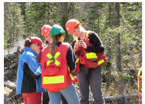
Quesnel Secondary students and teacher learn how to use a compass before laying out a block.