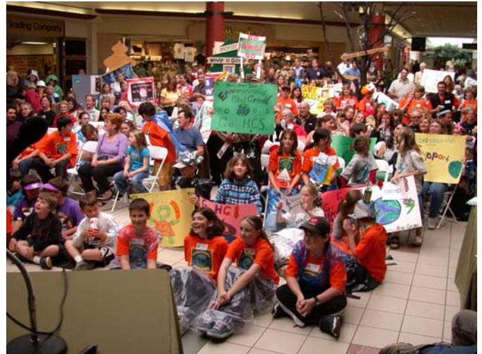
Kelowna crowds gather to cheer for local EMG teams